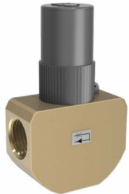
Nickel Aluminum Bronze