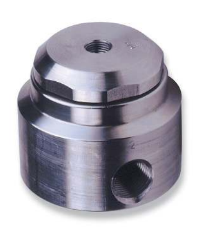
Corrosion Resistant Construction (for Illustration Only)