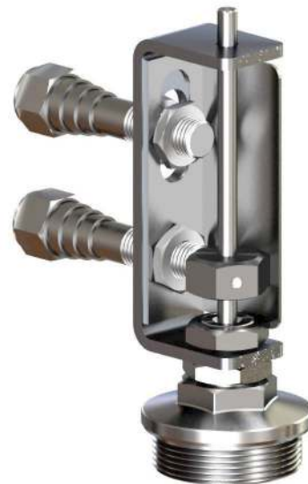
Proximity Limit Switch Assembly (Double Switch - SS9) (for illustration only)

The switch is equipped with Tungsten contacts and is electrically rated for 2 Amps at 24VDC.